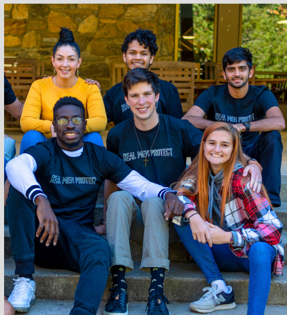
Y4A Students At Montreat College