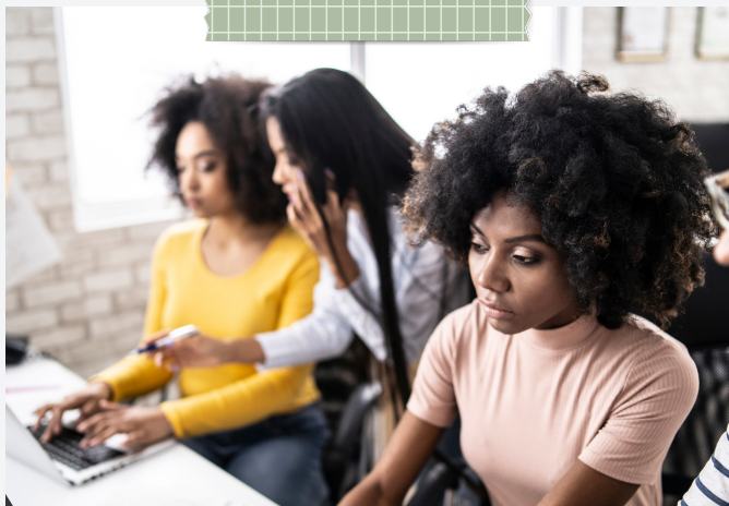
Provided 5 young women with paid internships!

"My Fields Of Hope® internship prepared me for my first job and I am working full time now. Thank you for giving me this opportunity to get my life back on track. I am excited about my future!"