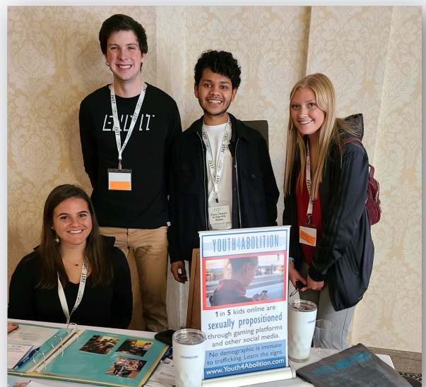
Y4A student leaders at the Shared Hope International Conference in Washington, D.C.