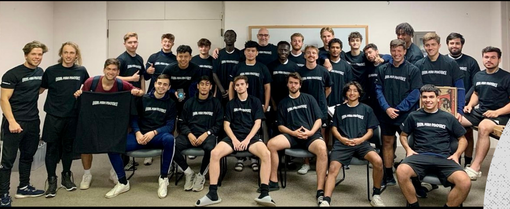
Montreat Men's Soccer Team Wear Real Men Protect T-Shirts